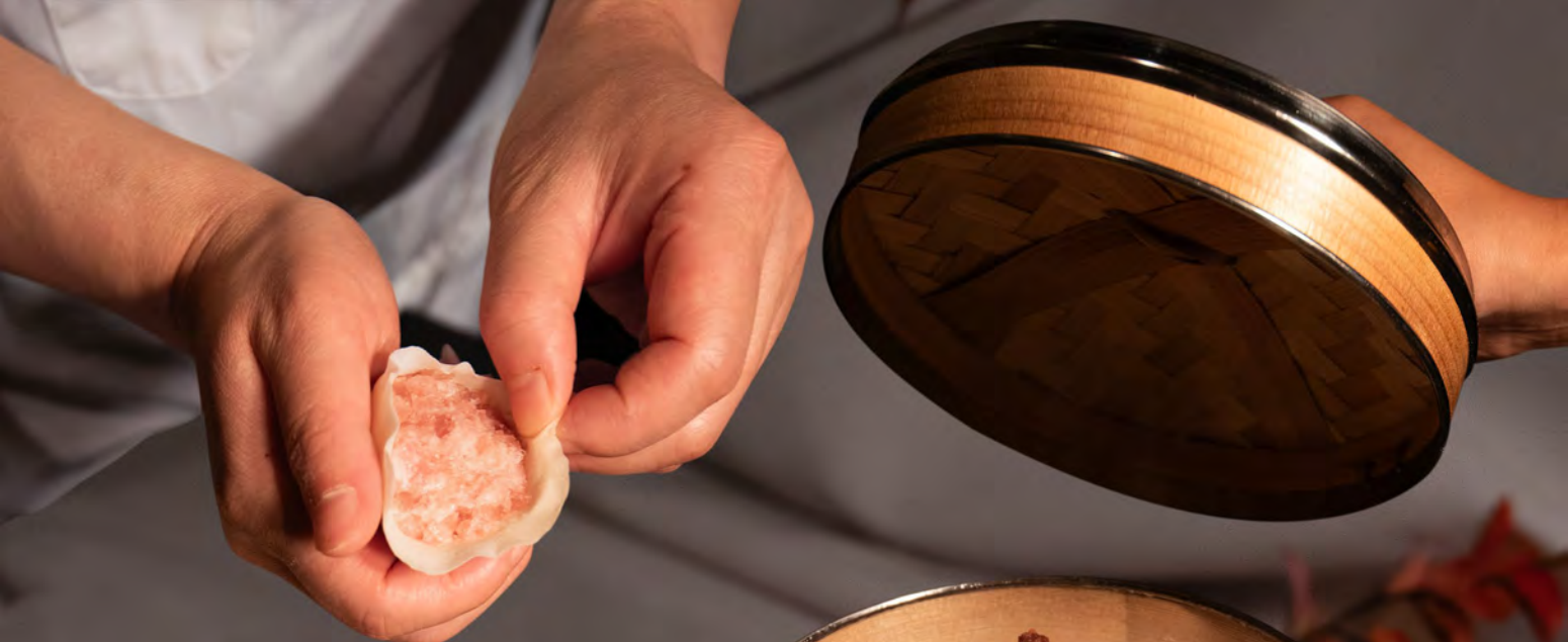
Signature Bao Platter 六色小笼包 $14