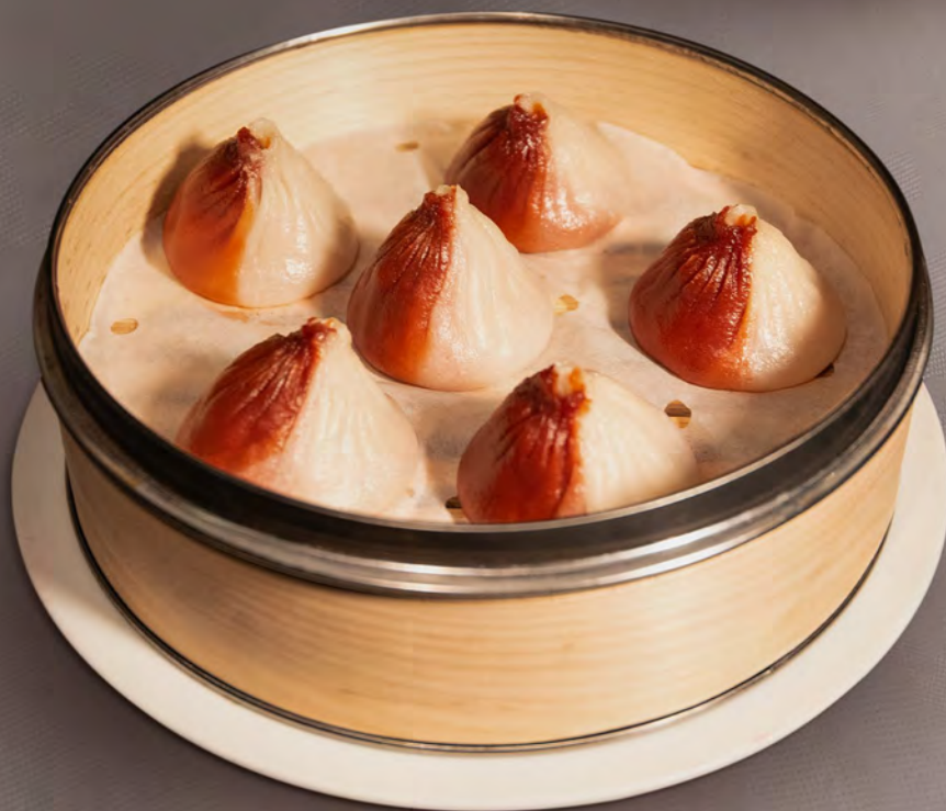
Wagyu Beef Xiao Long Bao 和牛小笼包 $19