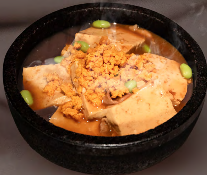
Sea Urchin Tofu 海胆石锅豆腐 $26

Stir-fried Lamb with scallion and cilantro