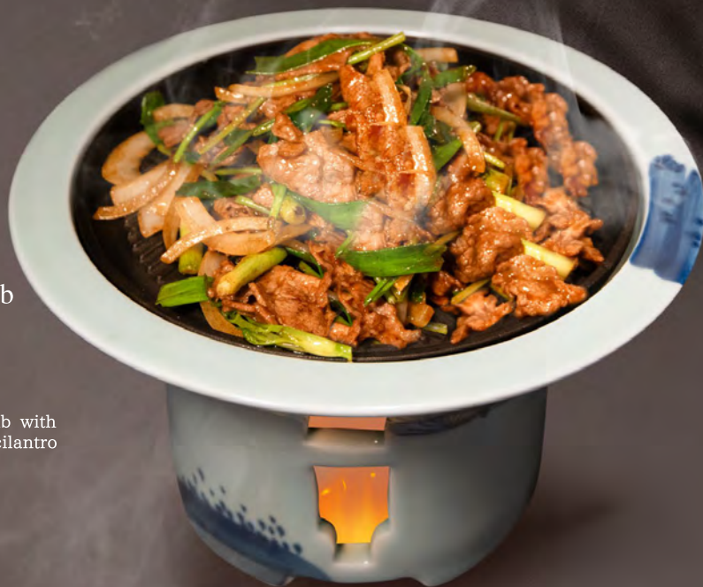
Beile Lamb 贝勒爷羊肉 $28

Stir-fried Lamb with scallion and cilantro